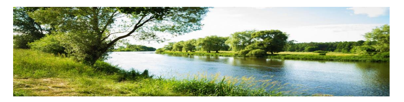
Suggested Gender-Related Indicators for Agriculture and Natural Resource Management Projects-

environment has a life-value that is the right of all people.